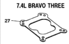
7.4L BRAVO THREE